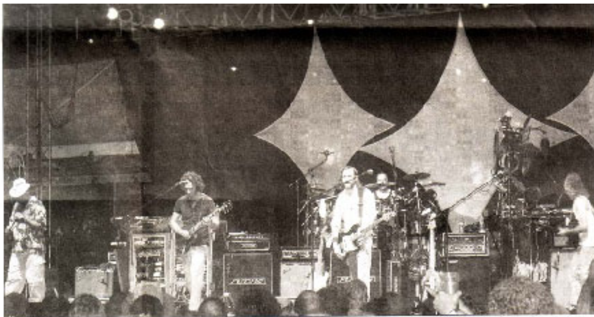
Zappa plays Zappa, featuring Dweezil Zappa, second from left.